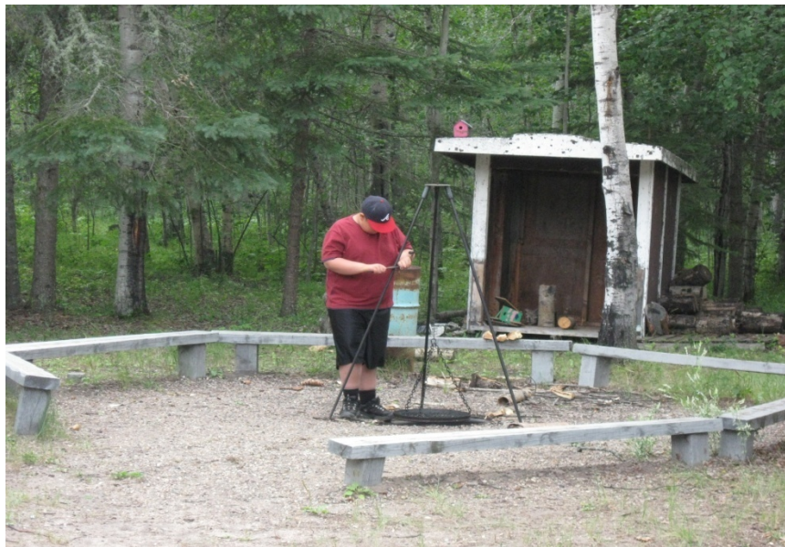
Photo from summer camp