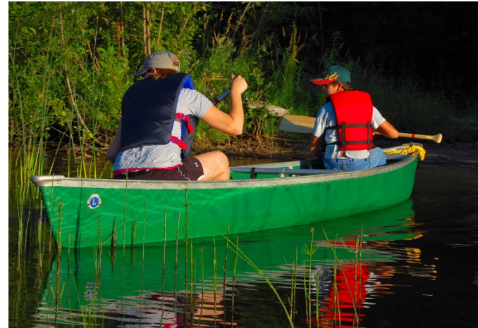
LCFASD summer camp