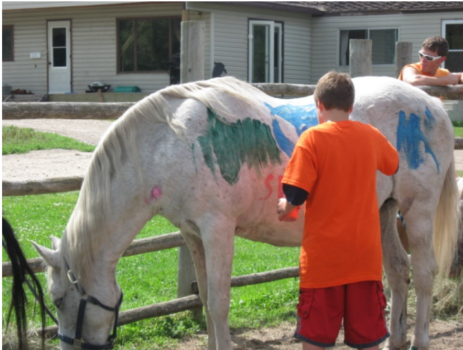
LCFASD summer camp