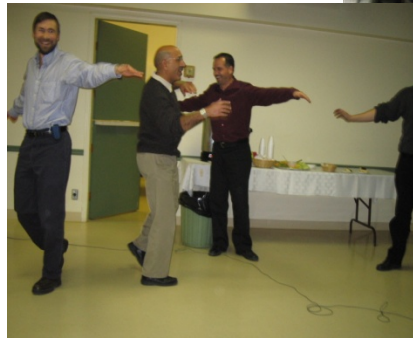
Diagnostic team retreat

IHE Consensus Development Conference on Fetal Alcohol Spectrum Disorder (FASD) – Across the Lifespan